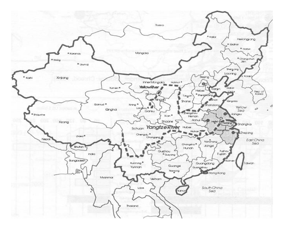
Figure 1: Map of the Yangtze Region

The main driver for economic growth in this region is the concentration of foreign investors which had become a major engine for economic growth for China. <sup>21</sup> In fact, China has been divided into twelve markets which are often distinct territories with each region having its own market characteristics. Because of these regional distinctions, foreign investors invested in the areas of interest which match their market characteristics. This led to the economic development of cities and provinces in China.<sup>22</sup>