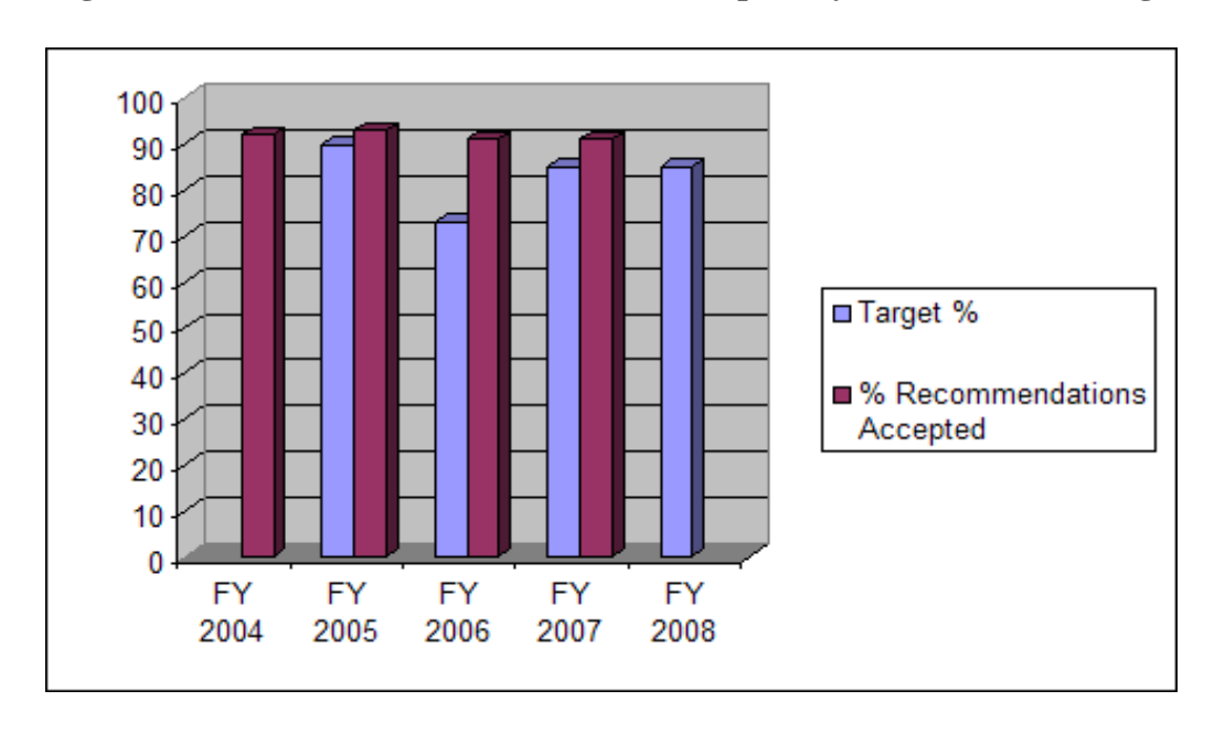
Figure 3: DHS OIG's Recommendations Accepted by DHS vs. DHS' Targets

Recommendations suggested by DHS OIG have been positively received by DHS managers. They have concurred with higher percentages of OIG's recommendations. The percentage of recommendations accepted average approximately 93% per fiscal year. This is indeed an excellent accomplishment of DHS OIG.