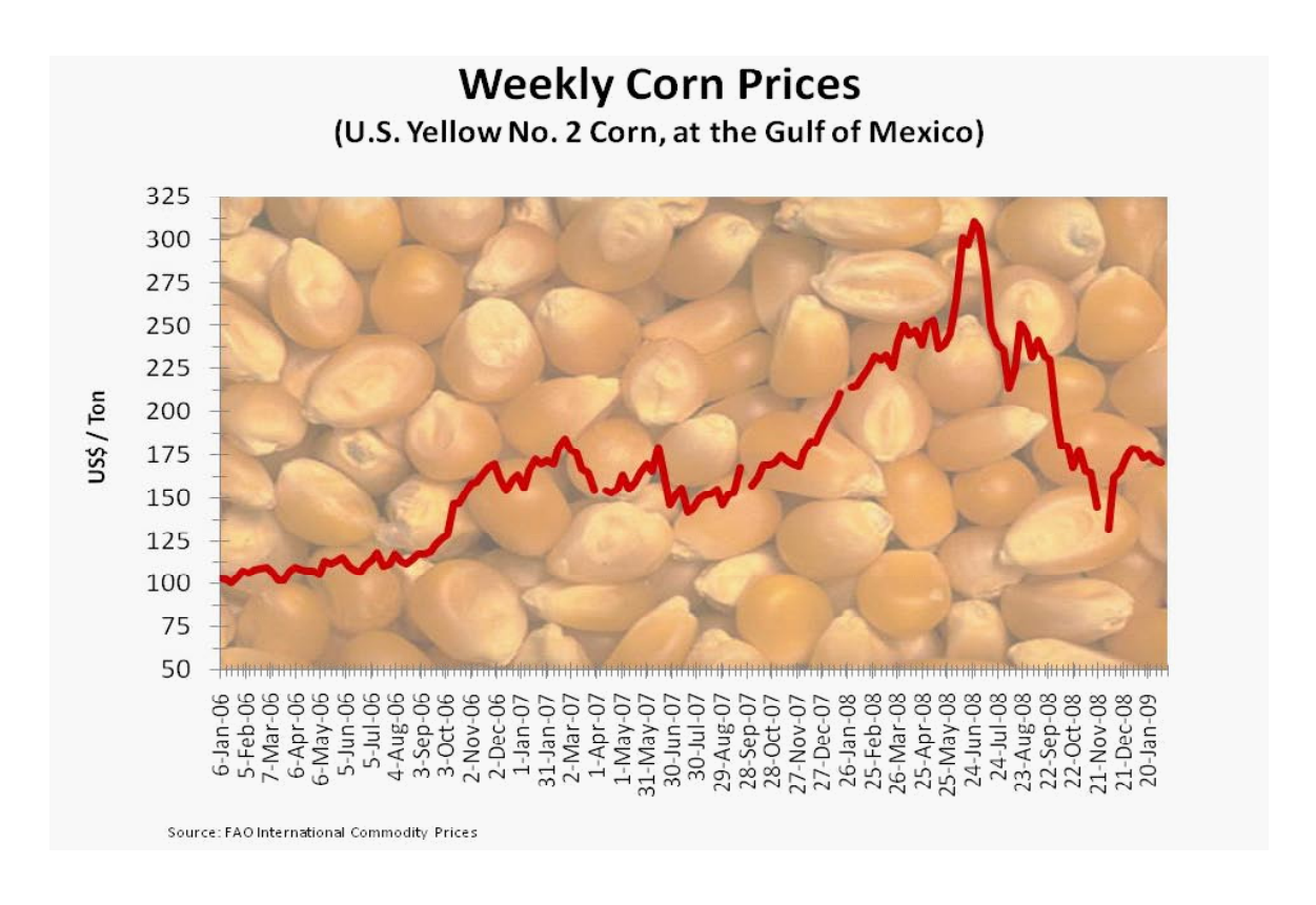
Figure 1 Weekly Corn prices