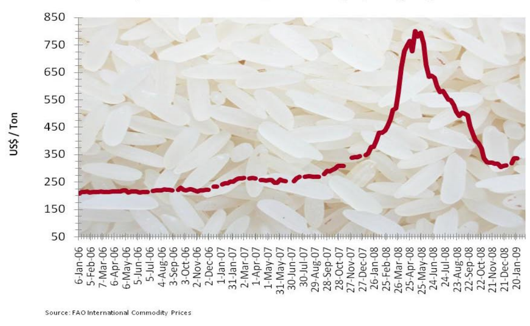
Figure 2 Weekly Rice prices